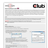
Quick install guide