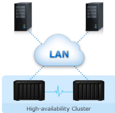
Figure 1) Reliability, Availability & Disaster Recovery

Synology High Availability ensures seamless transition between clustered servers in the event of server failure with minimal impact to businesses.