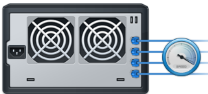
Figure 2) Superior Performance

Synology High Availability ensures seamless transition between clustered servers in the event of server failure with minimal impact to businesses.