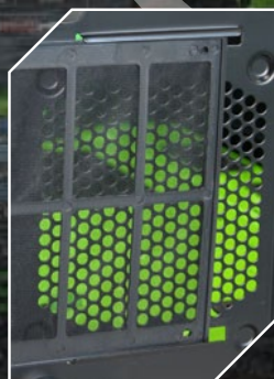
Dust filter for PSU air intake