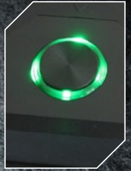
LEDs for power and HDD activity