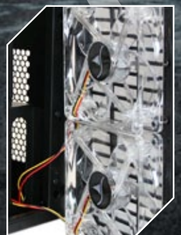
Front fan module with two pre-installed 120 mm LED fans and dust filter