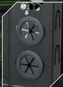
4 openings for water cooling