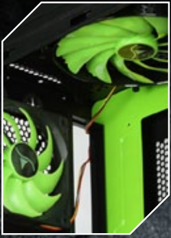
A colored 120 mm rear panel fan, a 170 mm top panel fan and air inlets in the side panel provide additional cooling.