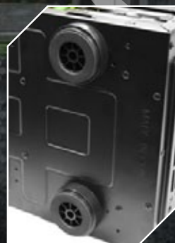
Decoupled case feet