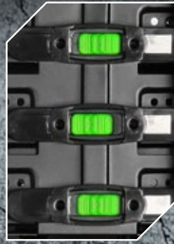
Screwless mounting for ODDs