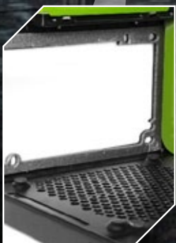
Decoupled PSU mounting