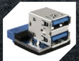
Internal USB3.0 adapter included