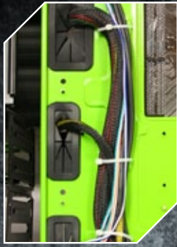
Cable management system