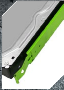
Decoupled HDD mounting